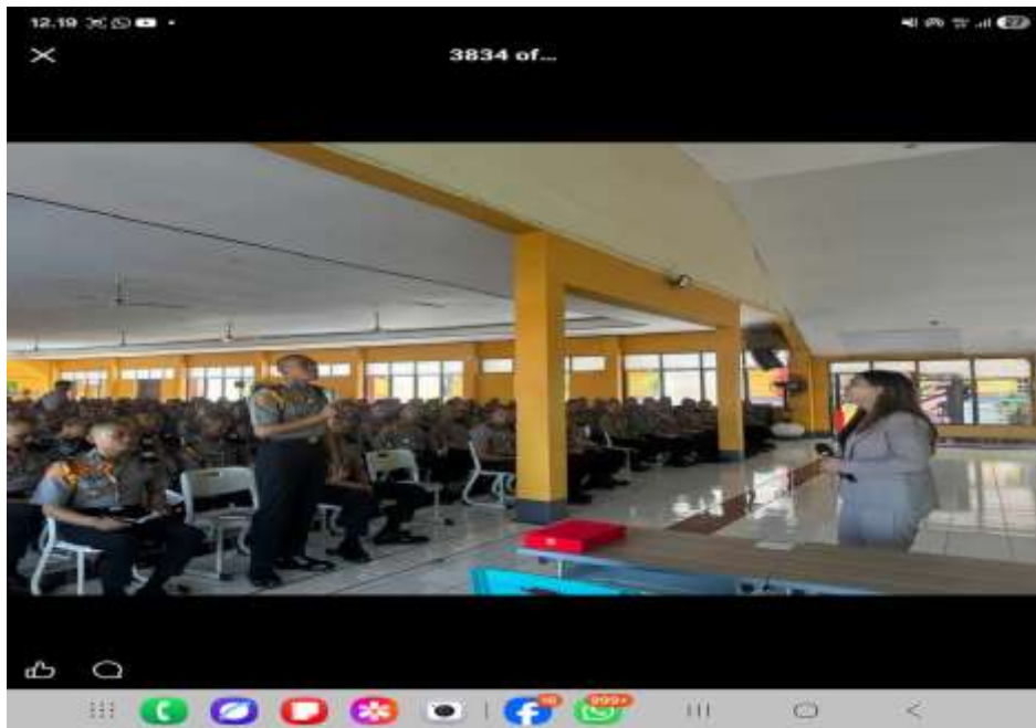
Fixture 1 Character-Building Seminars

Character-building seminars focused on core values such as integrity, discipline, honesty, service, empathy, and responsibility. The seminars employed interactive learning methods, including case studies, scenario analysis, and group discussions, allowing cadets to critically examine ethical dilemmas commonly faced in policing contexts. This interactive approach encouraged active participation and facilitated deeper internalization of Christian values, strengthening cadets' capacity for ethical decision-making and emotional self-regulation in complex operational environments.